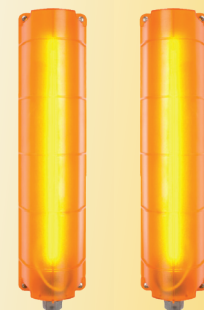
LED Guide Lights