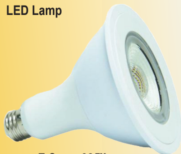
E-Saver 38™ LED Lamp