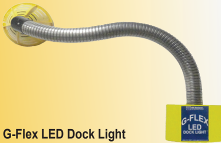
G-Flex LED Dock Light