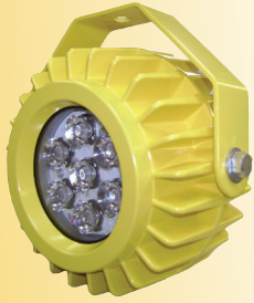
High Impact LED Dock Light