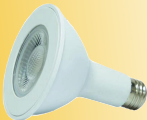
E-Saver 30™ LED Lamp