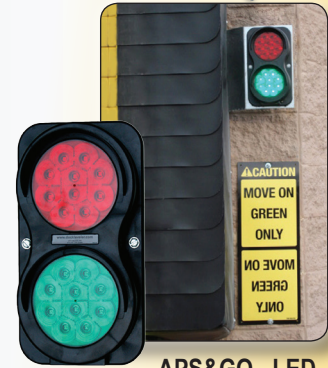
APS&GO - LED