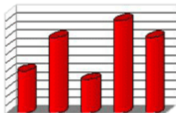
Unpredictable repair and replacement costs

Under the MPG, the customer pays a fixed monthly fee for the life of the agreement. In return the end user is able to depend 100% on the battery and charger covered under the program to supply the lift trucks with the power and productivity they require.