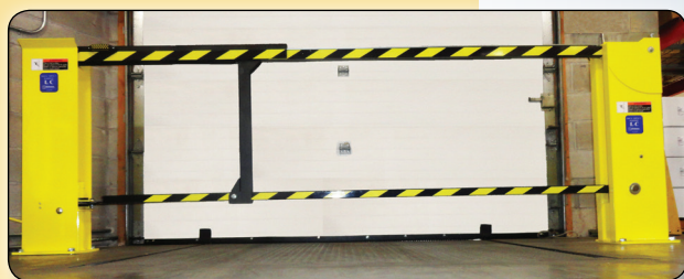
(Gas Spring Assisted)