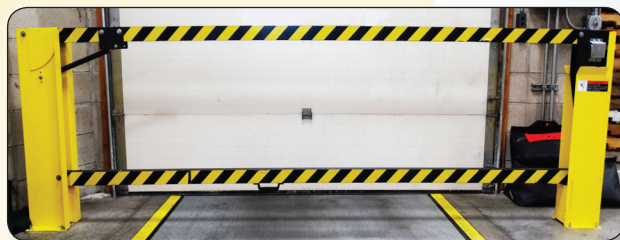
(Gas Spring Assisted)