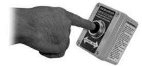
Standard Single Push-button Control Panel