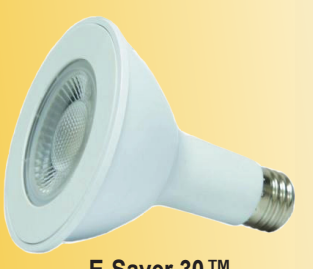
E-Saver 30™ LED Lamp