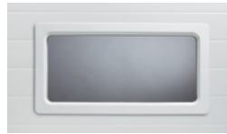
24" X 12" INSULATED GLASS Available with either a black or white frame.