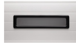
24" X 6" DOUBLE INSULATED ACRYLIC WINDOWS WITH BLACK FRAME