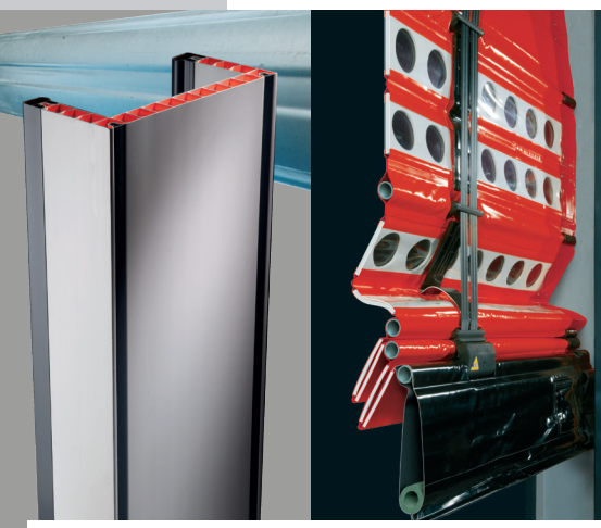
> Thermal break frame > Side guide with curtain