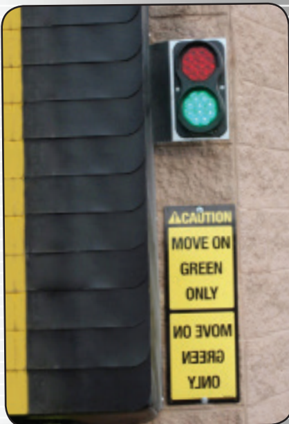
Outside Light Assembly