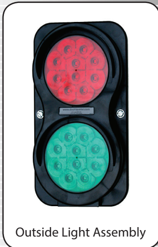
Outside Light Assembly

The APS&GO is an important communication tool for dock workers and truck drivers. It reduces the potential for serious accidents from truck drivers pulling away before loading/unloading is finished.