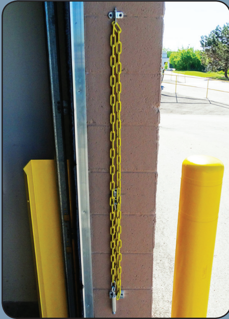
Figure 1: Dual Chain suspended from J-Bolt

The Dual Chain is a set of strengthened security chains used to help protect workers from edge of dock accidents. This protective product is anchored into the door frame, stretches across the dock and secured in corresponding receivers. The Dual Chain is a cost effective, easily installed barrier option.